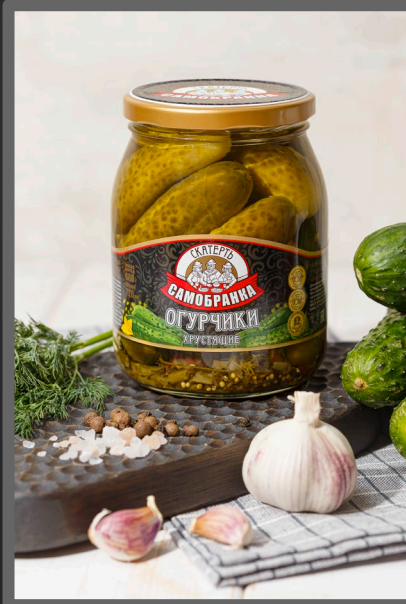
«SKATERT-SAMOB RankA» Marinated cucumbers 720ml