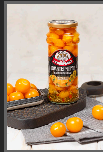
«SKATERT-SAMOB RankA» Cherry tomatoes "honey" 580ml