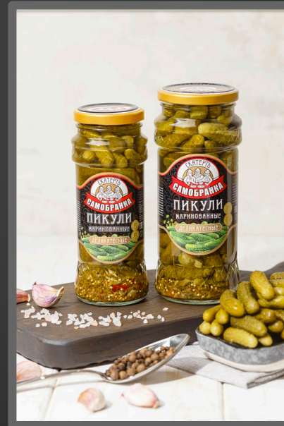
«SKATERT-SAMOB RankA» Marinated pikuli 370ml