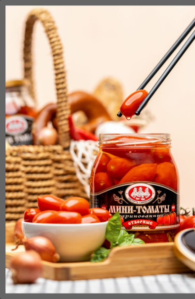
«SKATERT-SAMOB RankA» Marinated mini-tomatoes 720ml