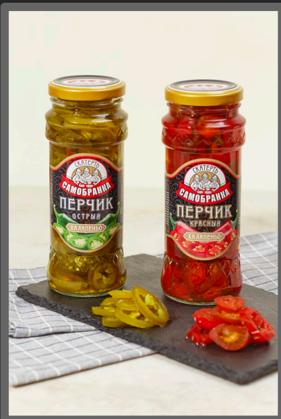
«SKATERT-SAMOB RankA» Jalapeno pepper red and green 370ml